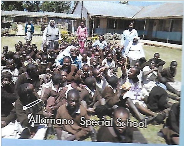
Allamano Special School

Peace and blessing to you our esteemed friends, and promoters of Missionary Sisters of Mary Immaculate. Of Nyeri. I would like to express profound gratitude to all our donors, sponsors, friends and well-wishers for partnering with us as we continue with God's mission. Over the past 100 years, we have grown because of your prayers, financial and moral support. I always get amazed at how the mysteries of God continue to unfold when we work as a team., numerous number of children have accessed education, a life changing reality for many. Families assailed by doubts and uncertainties of what the future holds for them been helped to live quality lives. Pope Francis, in his homily during World Youth Day reminded us that we need to let our eyes remain open to Jesus in our midst who is hopeful that He will get a drink from us. As the disciples of today who continues to transform the world, let us pray and never tire of seeing and hearing the voice of Jesus in the needy. My deepest gratitude and appreciation for outpouring of love and support which we have experienced from you over the years. Let's continue uplifting each other with our prayers and support.