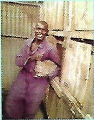
Pre-unit Pupils Graduating to class one